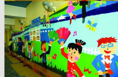
celebrate students' accomplishments.