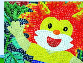
Colorful displays on the notice board

Our school is best realized by creating and maintaining inviting places which are intentionally inviting with others. A well maintained and carefully considered physical environment.